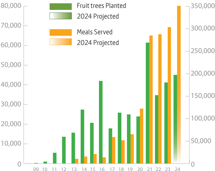
Fruit Trees Planted and Meals Served (2024 Projected)