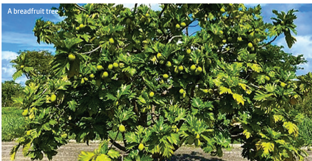
A breadfruit tree

You can also mail a check to Trees That Feed Foundation, 1200 Hill Road, Winnetka, IL 60093.