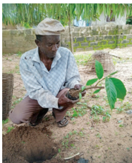
A Nigerian man planting a fruit tree with our partner Green Globe Initiative.

And these are not “pie in the sky” overly optimistic assumptions. Our yield, price and impact of fertilizer are based on our studies and surveys. We assume realistic levels of price and cost inflation. We figure in the delay before the tree bears fruit. And we figure in 33 percent losses from each year’s crop for whatever reasons. This number is realistic.