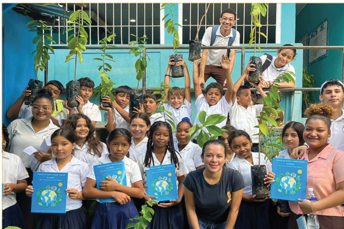
Environmental education for Escuela Arnaldo Auld in Coxen Hole, Roatan, Honduras.

Children are educated in and outside the classroom on the environment and importance of food bearing trees. They plant trees in the schoolyard and receive one to plant at home. The whole family benefits when the tree bears nutritious food in the backyard.