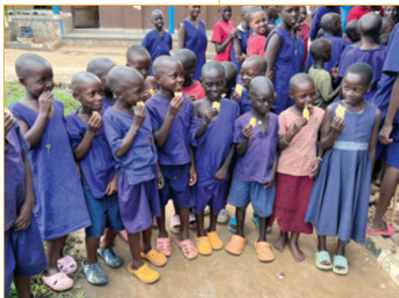
Children tasting breadfruit for the first time with TriTrees at Saint Maria Gorreti!