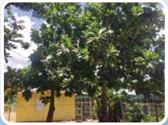
TTF has donated thousands of trees to schools. This tree gives cool shade over the playground at Pell River Primary School in Hanover, Jamaica

We plan to extend this work to other parts of Jamaica and other countries.