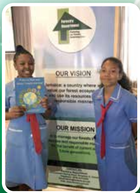
These young students are proud of their forestry project. They are the future of our planet.

A tip of the hat to our academic researchers and friends.