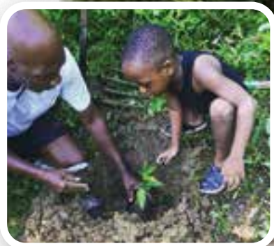
Haitian Dad teaching his son how to plant

Trees, educational books and food producing equipment ... many dimensions. As we help them, our partners at Hope for Health are helping us in return, leveraging up our mission and helping to increase production of solar dryers!