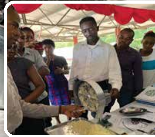
Demonstrating Nemco manual food shredder