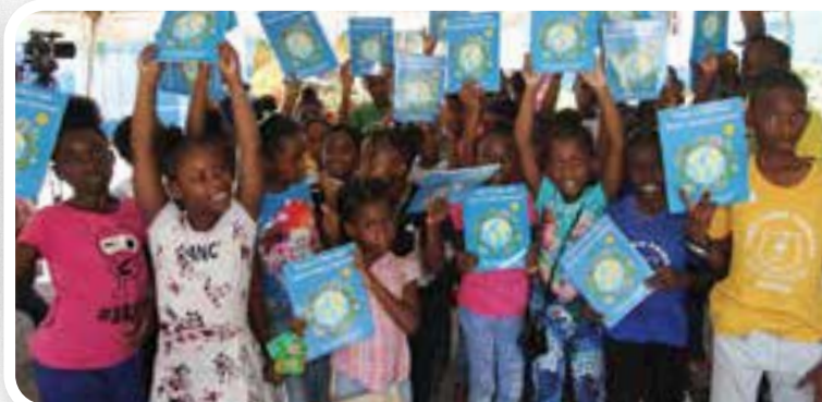
Natural History children with coloring books