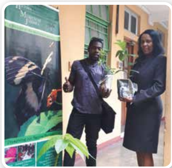
Natural History Exhibit

Trees That Feed looks forward to many more years of collaboration with this fine institution.