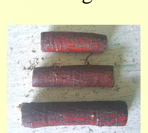
Fig. 1. Root cuttings 4 to 6 inches in length

Breadfruit can be propagated vegetatively by stem and, root cutting, volunteer suckers and to a lesser extent by air layering, and grafting. Tissue culture is currently being explored. Root cuttings is the method widely used where large numbers of plants are required. Root cuttings are normally selected from parent trees with high vigor, profuse bearing characteristics and produces fruits of good edible quality. Roots should be collected in the cooler parts of the day in early spring and late autumn for best advantage.